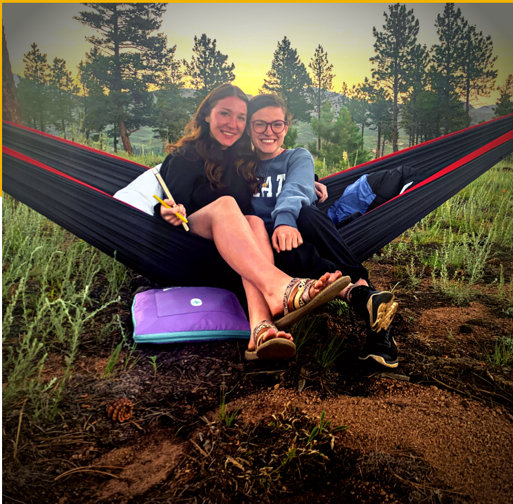
"There are people just like you, searching -you are not alone. You can trust Him."

"What is going on in your life that you are not satisfied with? What's holding you back from giving it all to Jesus? "